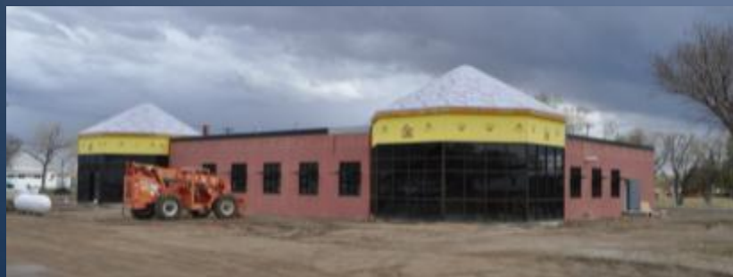
Phase I - Construction Progress