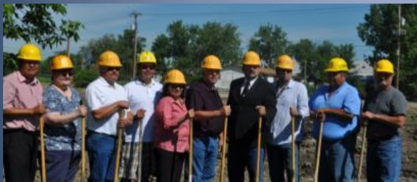
Traditional Ground Breaking Ceremony June 24, 2011